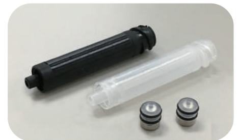
Toffutty Syringe × 20 (Option)